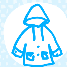
Weather-appropriate clothing (hat and/or rain jacket)