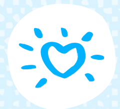
A sense of adventure. Getting a little wet or muddy can happen!