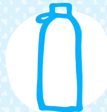
A bottle of water