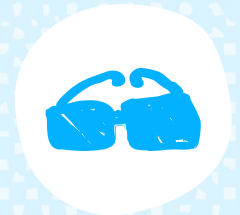
Sunscreen or sunglasses (in summer)